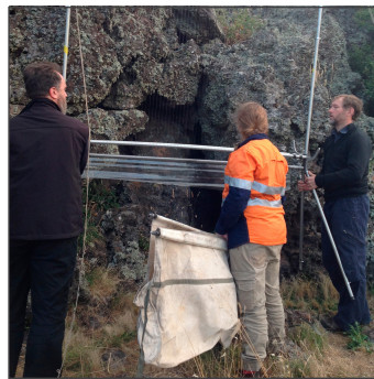
Consultants monitoring Southern Bentwing Bat habitat

Bat surveys include noise monitoring at 9 locations across the Mt Fyans site while surveys for the orchid targeted areas of potential habitat in the stony rise country in the northern section of the site. The following assessments and reports will form part of the